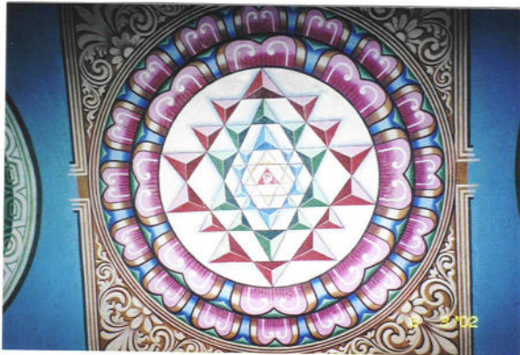
Location : Sri Mariamman Temple At South Bridge Rd

Besides being octagonal in shape, the roof is designed in such a way that there can be many lines of symmetry. Furthermore, not many people know of the triangular 'windows' on the roof which formed creates unique pattern.