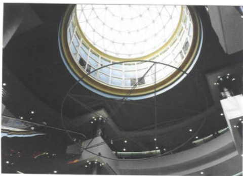
Pentagram hanging below domed skylight, Century Square, Tampines

I stood on the escalator to get this shot off. Kind of off-focus. The skylight is made up of triangles and the pentagram adds a dramatic touch.