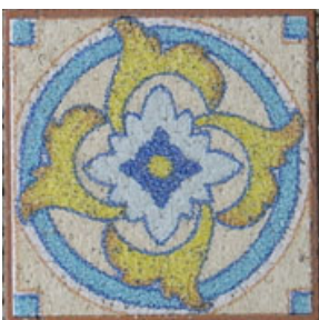
This is a pattern that has no lines of symmetry but it has 4 rotational symmetry.

These 4 tiles can be found in the compound of NUS, along the walkway from Arts and Social Sciences Faculty to the Kent Ridge Interchange.