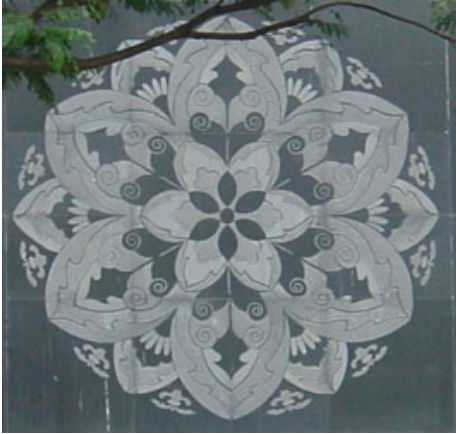
This pattern has 6 lines of symmetry and 6 rotational symmetry.

The patterns found at Shaw House are probably overshadowed by the big screen found on the same wall. However these are interesting patterns where one should take some time off to take a look at. Below are the patterns.