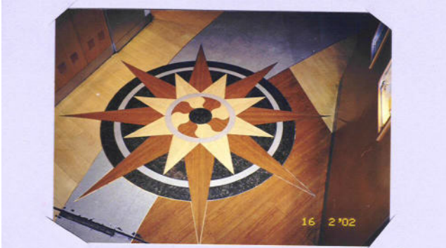
where? crown prince hotel's swensen's at orchard (found it when i was having ice cream, stood on a chair & snap it - everyone was STARING at me!)