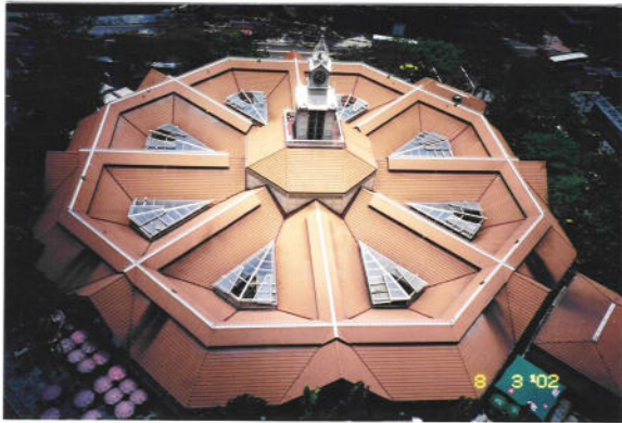
Location : Lau Pa Sat

Besides being octagonal in shape, the roof is designed in such a way that there can be many lines of symmetry. Furthermore, not many people know of the triangular 'windows' on the roof which formed creates unique pattern.