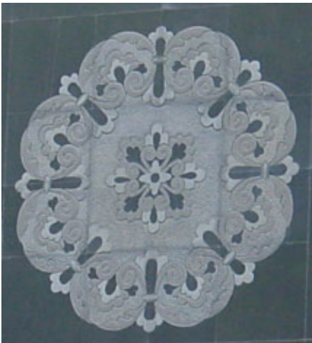
This pattern has 4 lines of symmetry and 4 rotational symmetry.

These 4 tiles can be found in the compound of NUS, along the walkway from Arts and Social Sciences Faculty to the Kent Ridge Interchange.