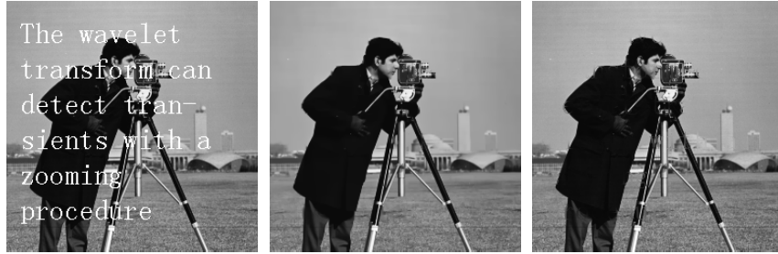
FIGURE 1. Inpainting in the image domain for the “cameraman” image. Columns (from left to right) are the observed corrupted image, the recovered image by the analysis-based approach (3.3), and the recovered image by the balanced approach (1.5). The PSNR values of the recovered images are 35.7742 and 34.3899 respectively, with corresponding number of iterations being 9 and 100.

translates into knowing part of the information in the transform domain but not the image domain. Therefore the application is for the case \Lambda = \emptyset and \Gamma \neq \emptyset in our model, and we take K = 2 in our implementation. Readers can refer to [2] on how the index set \Gamma is obtained from the low-resolution images and [1, 7] for more details about super-resolution image reconstruction with multiple sensors.