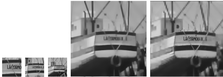
FIGURE 3. Super-resolution image reconstruction with different zooms for the “boat” image. Columns (from left to right) are part of the original image, part of a low-resolution image from 2 \times 2 sensors, a low-resolution image from 4 \times 4 sensors, the reconstructed high-resolution image by the analysis-based approach (3.3), and the reconstructed high-resolution image by the balanced approach (1.5). The PSNR values for the analysis-based approach and the balanced approach are 25.7972 and 24.9855 respectively.