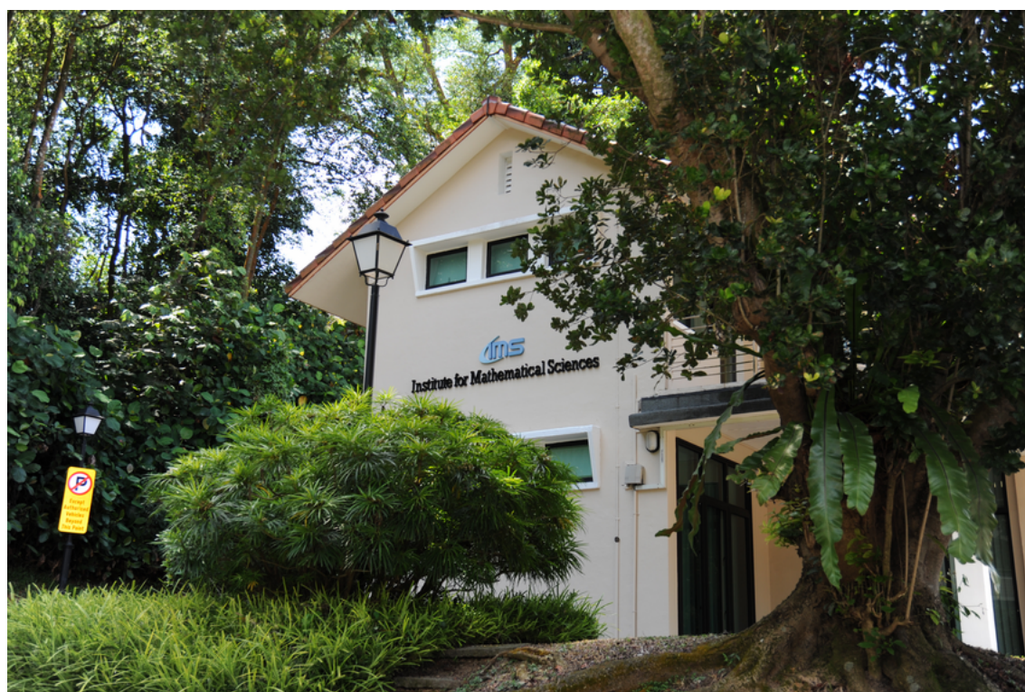
Institute for Mathematical Sciences 7

In 1998, the University set up the Department of Statistics and Applied Probability, and the group in statistics moved to the new department. This move resulted in the reduction of faculty size in the Department of Mathematics, and the number of tenure track faculty since then hovers between 55 and 65. Despite this, the quality of mathematical research continued in the upward trend. Evaluation of research performance shifted from the number of papers published in international refereed journals to the quality and significance of work done.