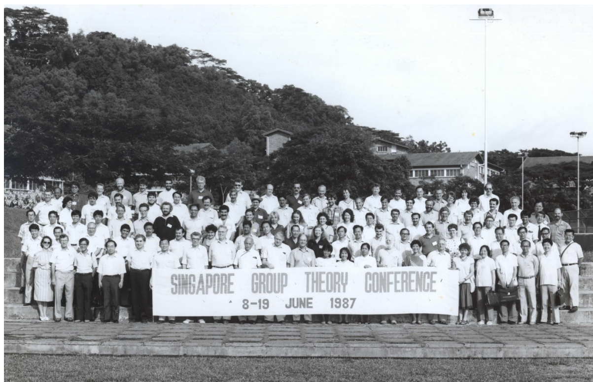
Singapore Group Theory Conference, June 1987 5

Research funding for the basic sciences began in 1980 upon the merger of Nanyang University and the University of Singapore to form the National University of Singapore (NUS). The 1980s was a period of rapid growth in mathematical activities. With the merger, the Lee Kong Chian Centre for Mathematical Research was then a centre in the new department in NUS. It provided financial support for mathematical conferences organized by the Department and the Society. An international conference was held almost every year during this period, each devoted to a specific field. These included group theory, analysis and topology. Each conference brought in leading figures in the field.