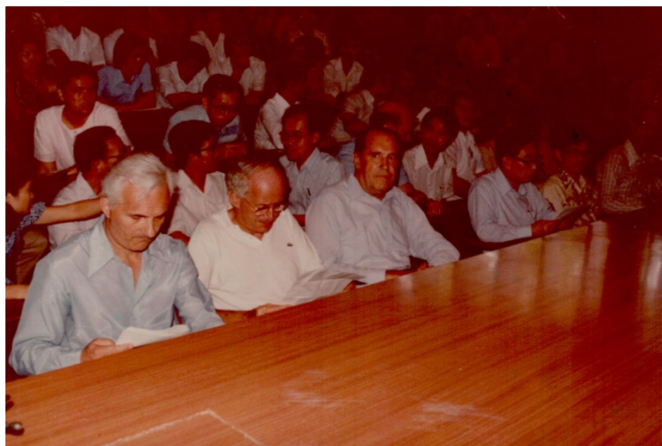
Left to right: J-L. Lions, L. Schwartz and J. Dieudonné 3